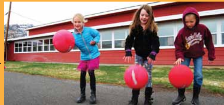
New playground equipment for SV Elementary recesses!