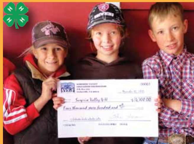
Raised $4,700 for the Surprise Valley 4-H