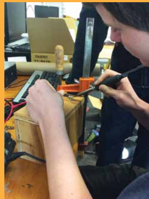
Soldering parts for the ham radio