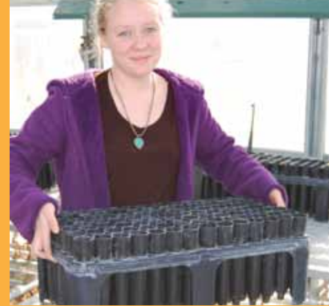
Getting the greenhouse all ready to plant