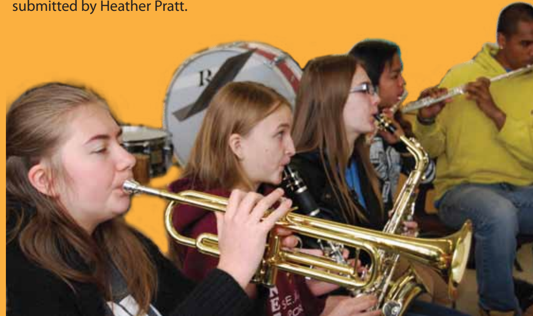
Brand new instruments for the new SVHS band!