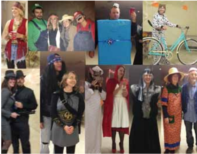
SVEdF Costume Ball Fundraiser 2014

Check out our website for upcoming fundraising events or look for our booth at many Surprise Valley events. Help our youth have a better future and contribute to this worthy cause!