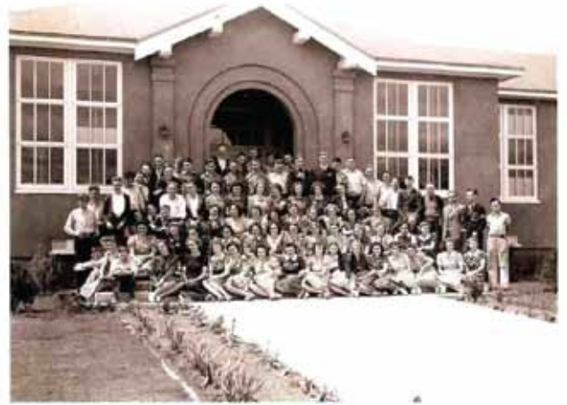
Surprise Valley High School, 1940